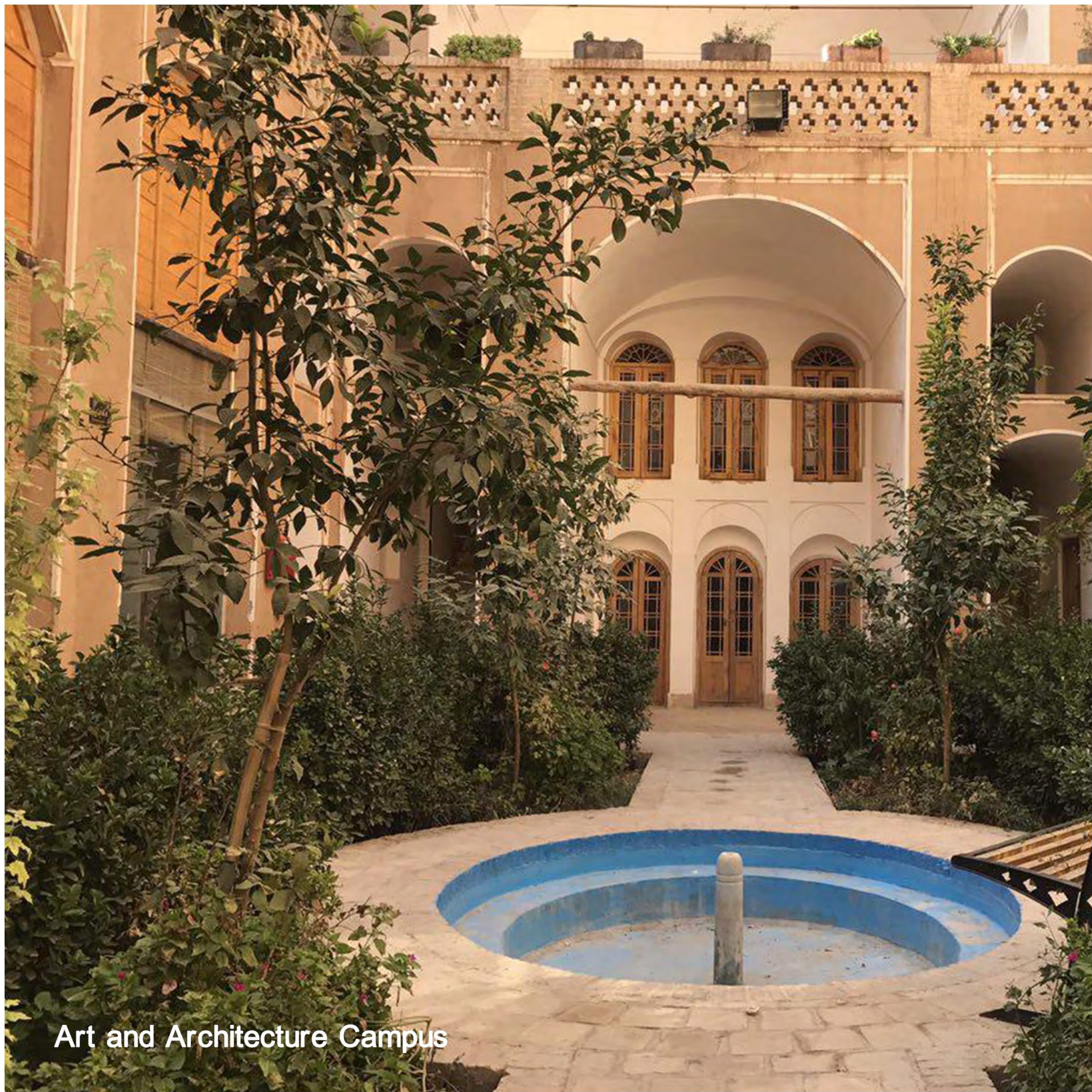
Art and Architecture Campus