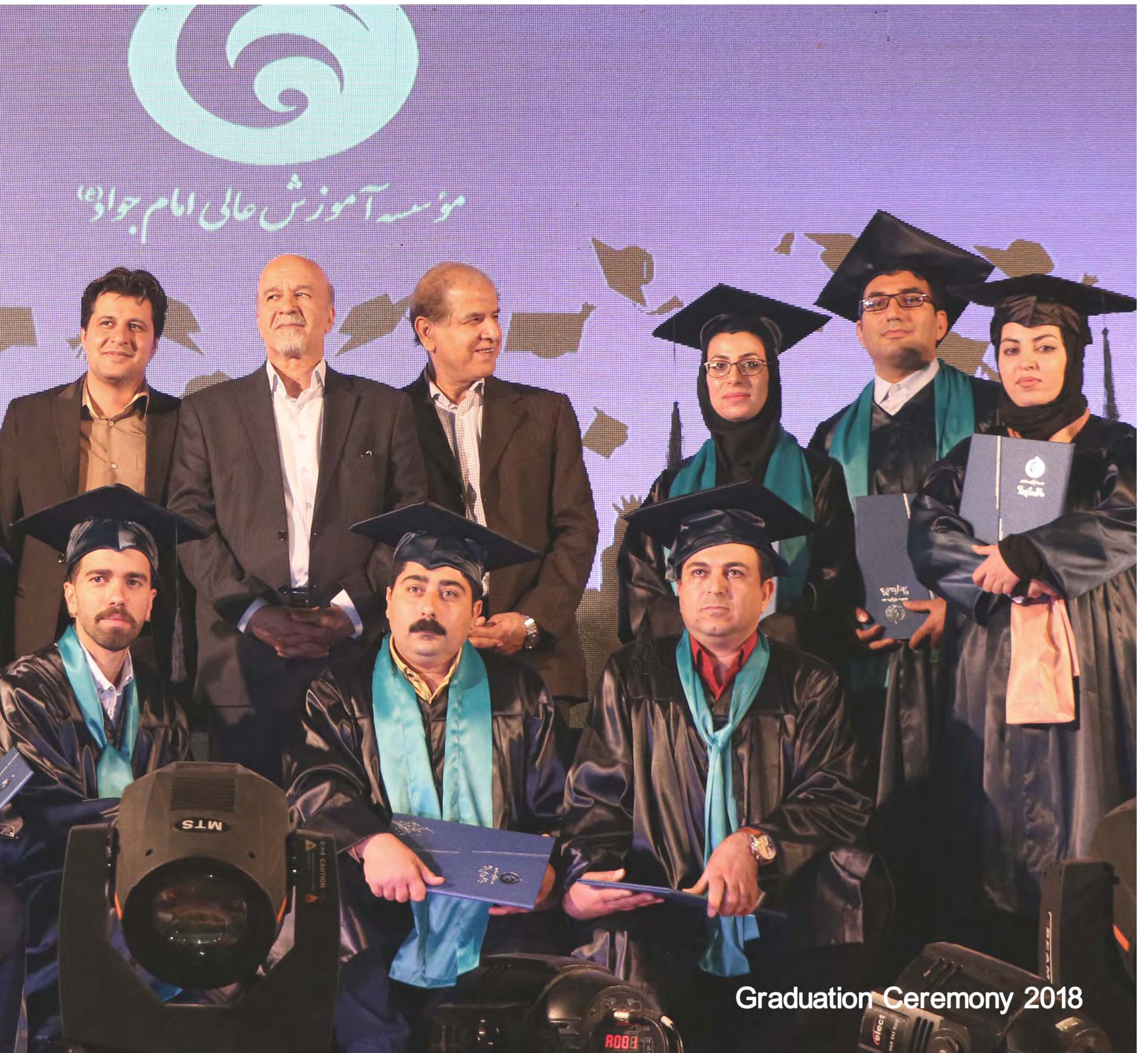
Graduation Ceremony 2018