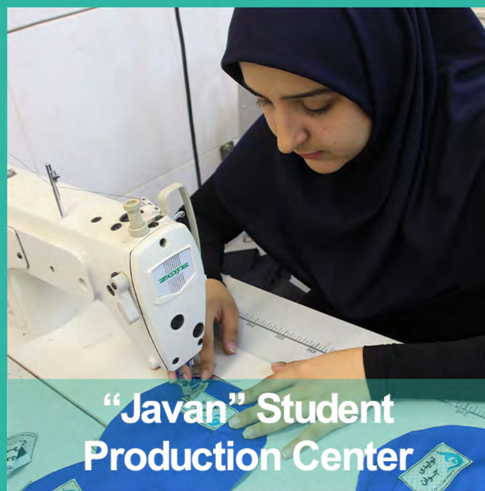
"Javan" Student Production Center