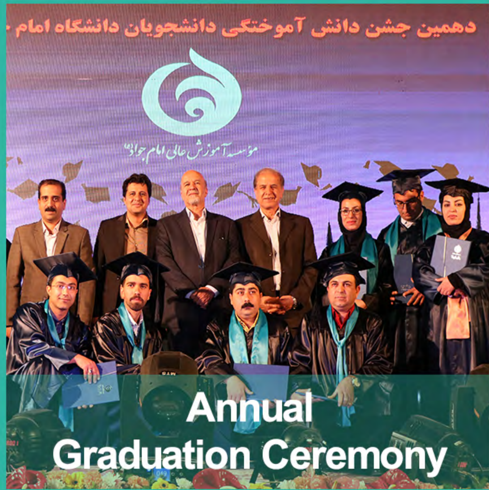
Annual Graduation Ceremony