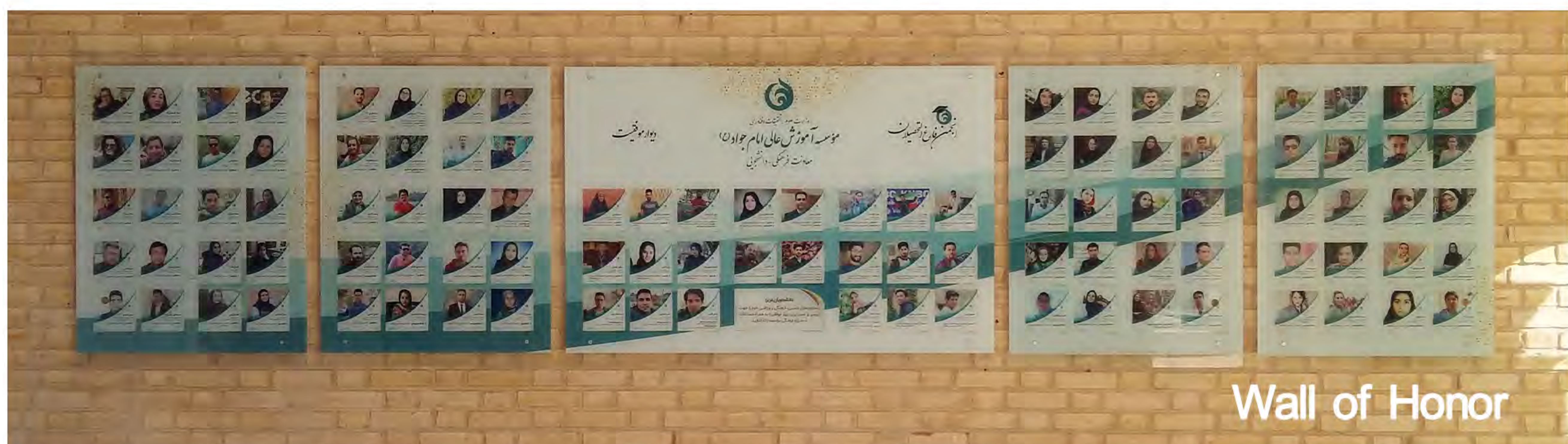
Wall of Honor